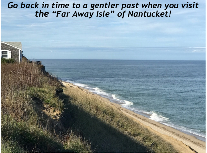
Go back in time to a gentler past when you visit the "Far Away Isle" of Nantucket!

Full payment due with reservation. Cancellation Policy: Before 8/3/2024—Partial refund. (If, & only if, we can find someone to take your place on the trip will we be able to grant a full refund during this time.) After 8/3/24—No refund. Please note: Motor coach seating is assigned according to the date & time we receive your reservation (excluding accommodations for special needs), starting 10:00 AM on the established first date of sign up. Non-members traveling with us must do so as the guest of a current club member. One guest per member, unless otherwise specified. Individuals who require special attention must bring someone to assist them. A Yankee Line, Inc. acts only as an agent for the various independent suppliers that provide hotel accommodations, transportation, sightseeing, activities, or other services connected with this tour. Such services are subject to the terms & conditions of those suppliers. A Yankee Line, Inc. & their respective employees, agents, representatives, & assigns accept no liability whatsoever for any injury, damages or expenses of any kind due to sickness, weather, strikes, hostilities, wars, terrorist acts, acts of nature, local laws or other such causes. A Yankee Line, Inc. is not responsible for any baggage or personal effects of any individuals participating in the tours/trips arranged by A Yankee Line, Inc.