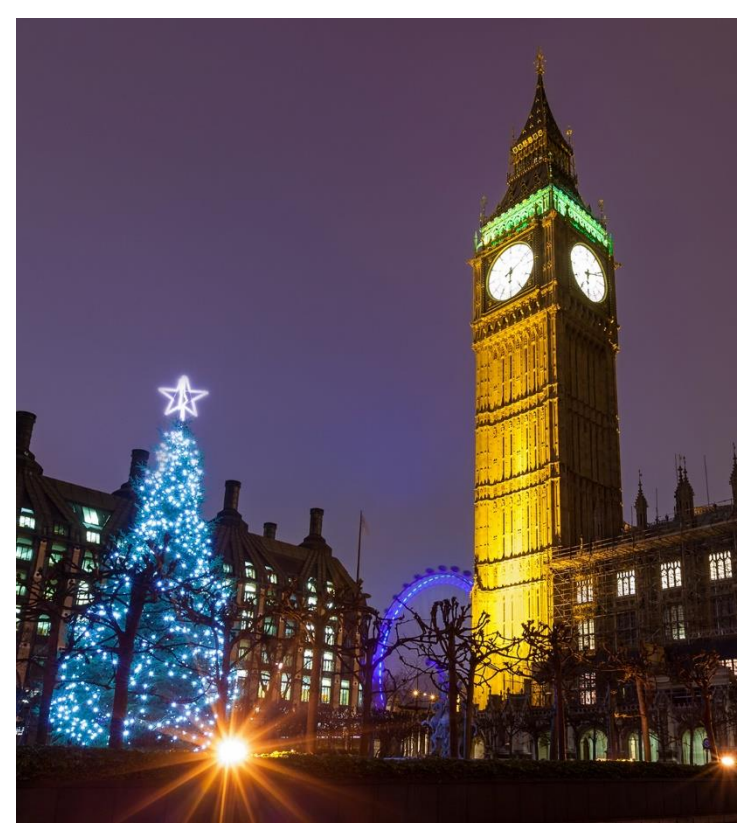
7 Days • 12 Meals: 5 Breakfasts, 2 Lunches, 5 Dinners

HIGHLIGHTS... Buckingham Palace, Big Ben, Christmas Markets, Covent Garden, Greenwich, Culinary Walking Tour, Blenheim Palace, St. Paul's Cathedral, London's South Bank